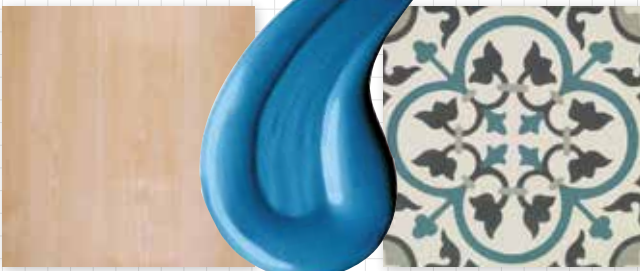
FROM LEFT: Chene PBS33 wallpaper, £xx per 10m roll, Nobilis. G21 Reidun alterier matt emulsion, £32.63 for 2.5l, eicó. St Etienne encaustic floor tile, £224.70 per sq m, Toulouse collection at Fired Earth