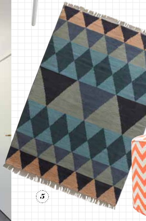
1 Norm 12 plastic pendant, £88, Simon Karkov for Normann Copenhagen 2 Tall Amber glass bottle, £35, A Rum Fellow 3 Classic wood, metal and cotton ride-on-plane, £135, Moulin Roty at AlexandAlexa 4 Occa 3800 coffee tables in walnut- and white-painted veneer, £369 each, BoConcept 5 Sails wool rug (W140 x L200cm), £425, Loaf 6 Chevron cotton pouf in Orange, £57.71, anitascasa at Etsy 7 Tom Foolery steel and brushed-cotton right-handed corner-group sofa in Grey, £3,279, Sofa Workshop