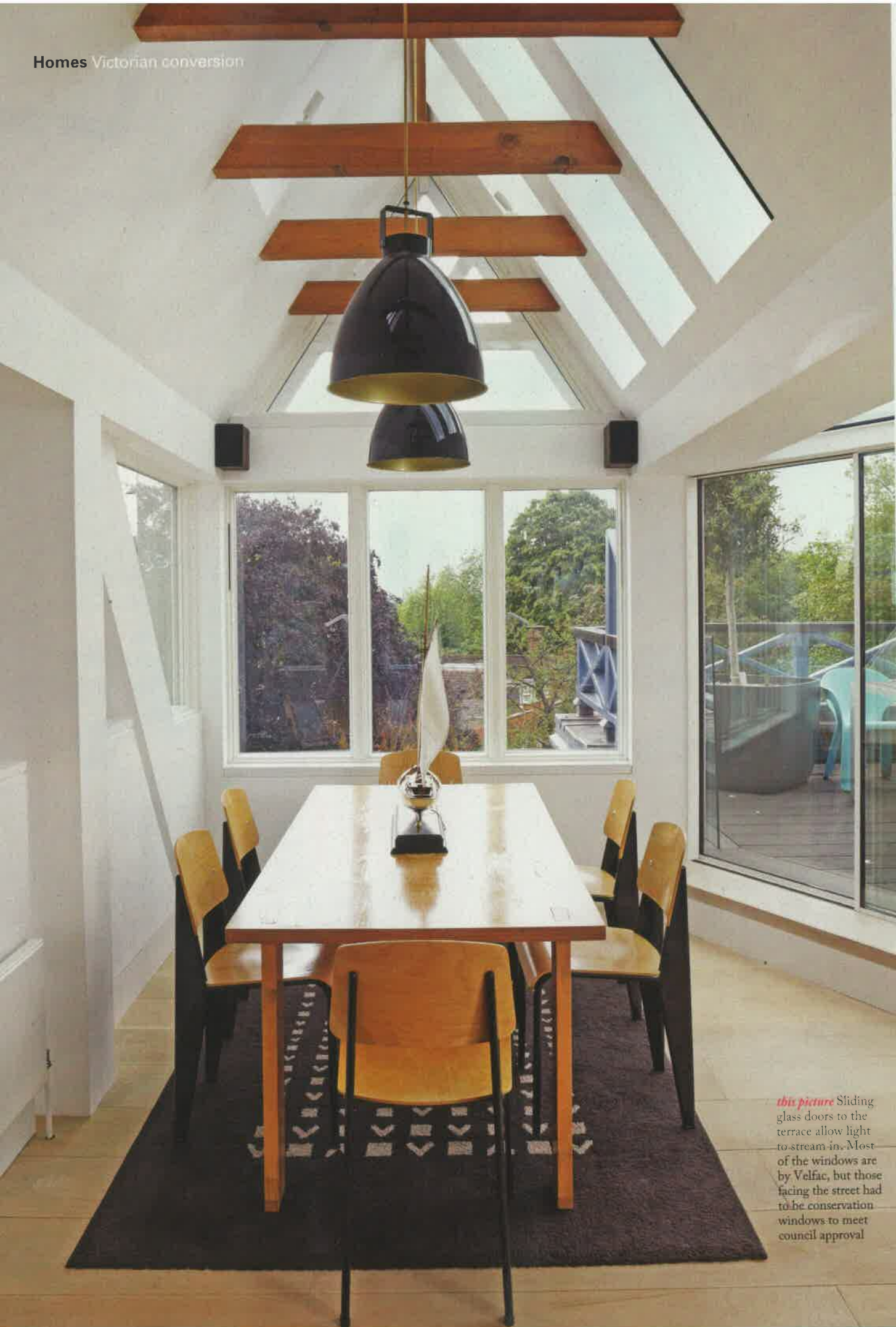
this picture Sliding glass doors to the terrace allow light to stream in. Most of the windows are by Velfac, but those facing the street had to be conservation windows to meet council approval